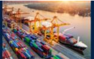
SHIPPING & TRANSPORTATION