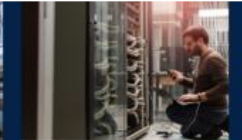
IT & TELECOM