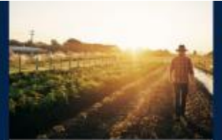
FOOD & AGRICULTURE