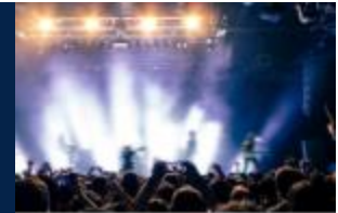
STADIUM & EVENT VENUES